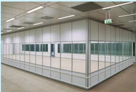
Temporary isolation rooms

Our framing systems can help support the needs of medical providers to scale up their operations. Take a look at some examples of how Bosch Rexroth can help!