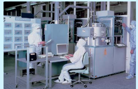
Labs and clean areas